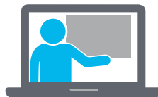
Educación en línea