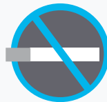
Dejar de fumar/nicotina