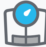
Control del peso